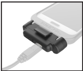
RAM® Snap-Con™ GDS to Micro USB 2.0 Adapter P/N: RAM-GDS-AD1U