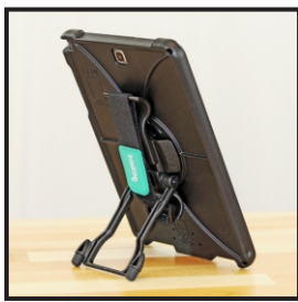
RAM® HandStand™ P/N: RAM-GDS-SS1U